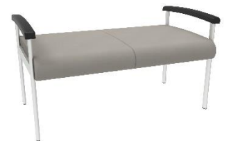
Vista II Series