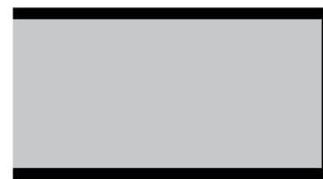
3mm PVC Edge